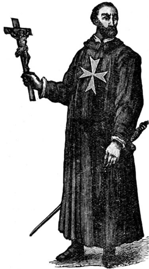
CLERIC TURN UNDEAD TABLE

A result of D means dissolved / destroyed (up to 2d6 in number).